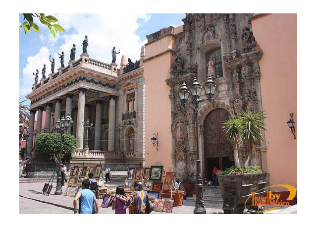
V International Symposium on Experimental Mechanics & IX Symposium on Optics in Industry Guanajuato, Mexico, 17 to 21 August 2015.