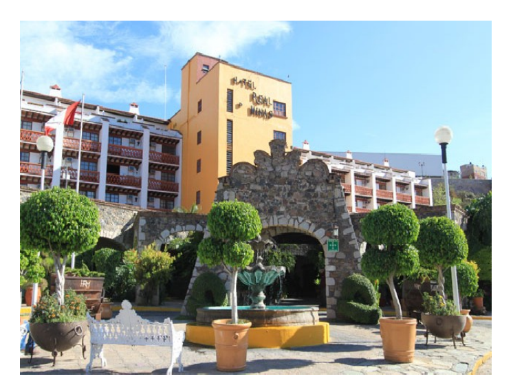
V International Symposium on Experimental Mechanics & IX Symposium on Optics in Industry Guanajuato, Mexico, 17 to 21 August 2015.

The city hosts the anual Cervantino Festival, a festival of performing arts that is named in honor of Miguel de Cervantes Saavedra, autor of Don Quixote, and statues of him and his sidekick, Sancho Panza, in the Allende Plaza just outside "Teatro Cervantes" (Cervantes Theater).